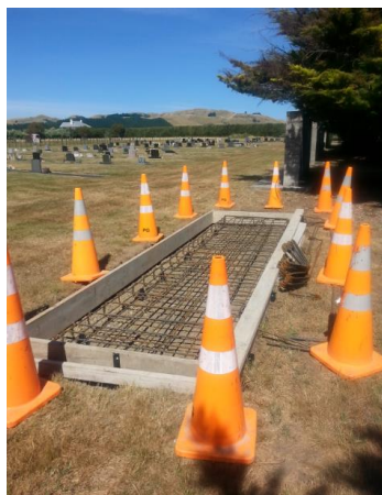
Martinborough Cemetery – Ashes Wall 6 – 33 Niches Completed

A new ashes wall for Martinborough will be erected in the New Year.