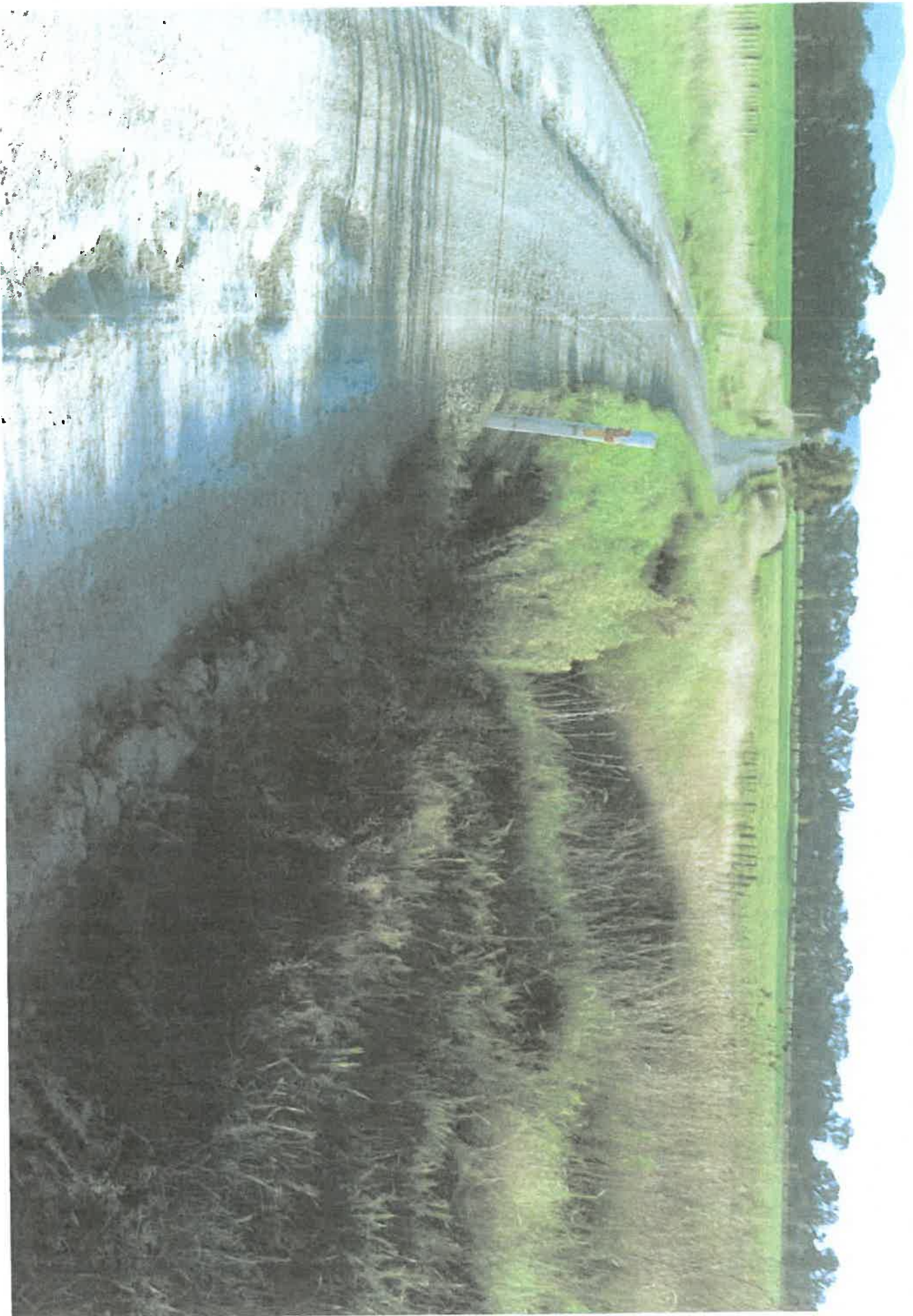
Holes w. Road.