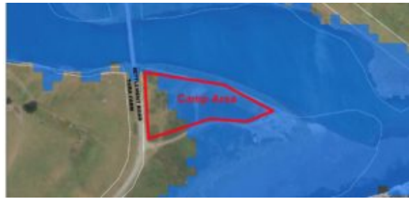
Map of the campsite at Tora, showing potential flood zone.

"We have stayed there over the past 12 years and have never been caught in a flood," Diane Barnes said.