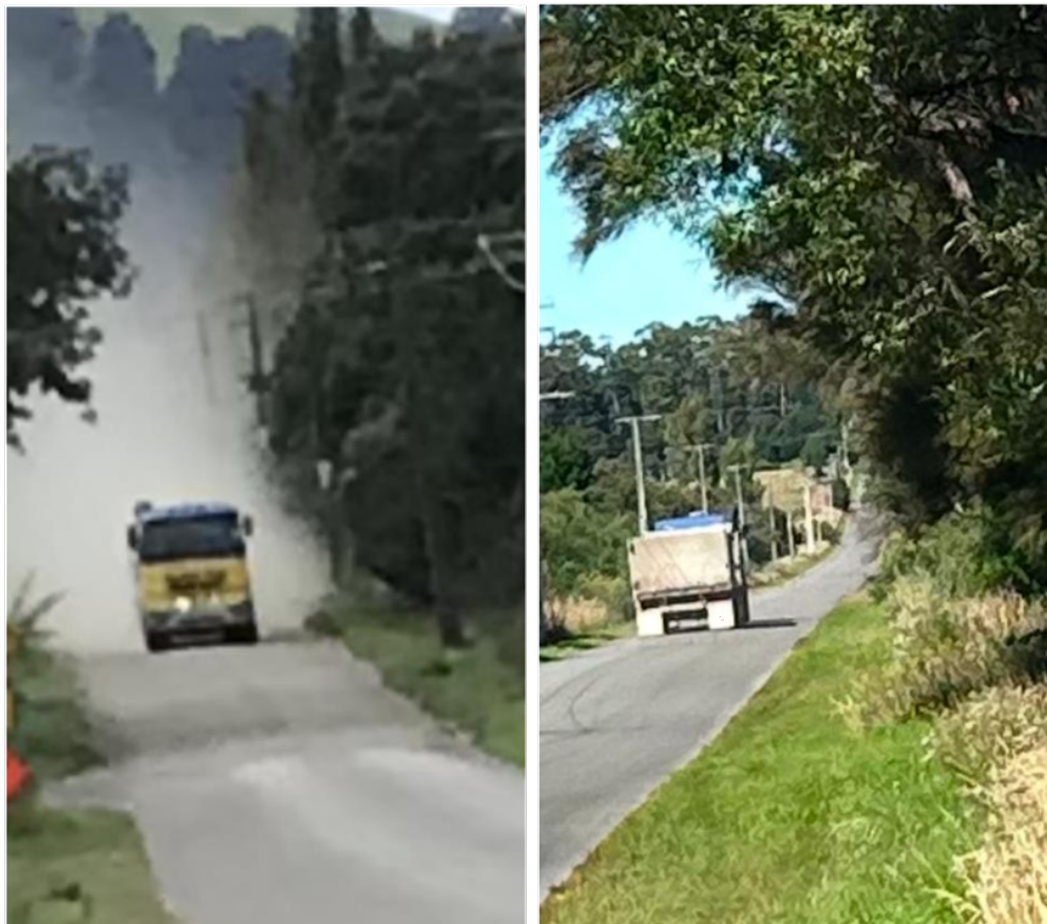
Image 22: Clouds of dust raised up by a heavy truck, completely obscuring Underhill Road

Why should vulnerable road users be expected to pull aside for heavy trucks? Even if drivers are courteous, the dust clouds created by quarry traffic can make it impossible to see anything on the road. This is especially bad in the summer, when there are not only more cyclists and walkers but also increased holiday traffic to and from the DOC campsite and swimming hole on Bucks Road. Even ordinary weekdays will see up to 20 heavy vehicle movements to and from the quarry year-round. These trucks, often with attached trailers, are noisy and create vibrations that can be felt inside homes.