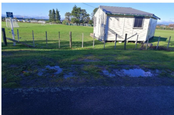
Image 11: Verge after Saturday morning football matches, 22 June 2025