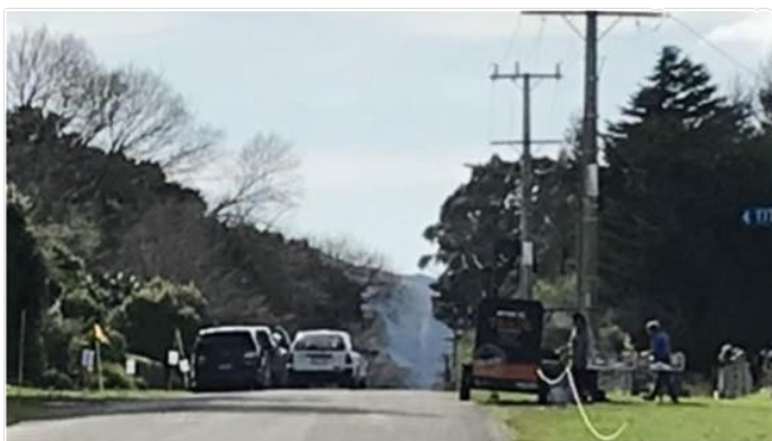
Images 13-16: Junior football festival 2023, showing inadequate parking infrastructure for cars, trailers and buses, and lack of pedestrian safety measures near Titoki Grove