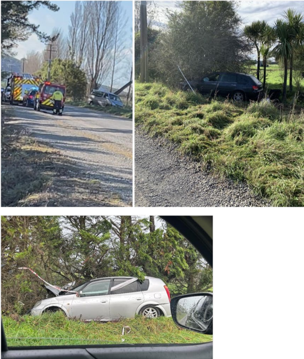
Images 19-21: Three vehicle accidents on the gravel section of Underhill Road in 2024

Council staff acknowledged safety concerns in the original Featherston Quarry consent, stating: