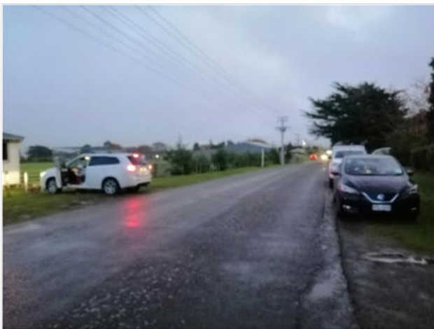
Images 5-7: Vehicles and families on Underhill Road after football practice, dusk, 12 June 2025