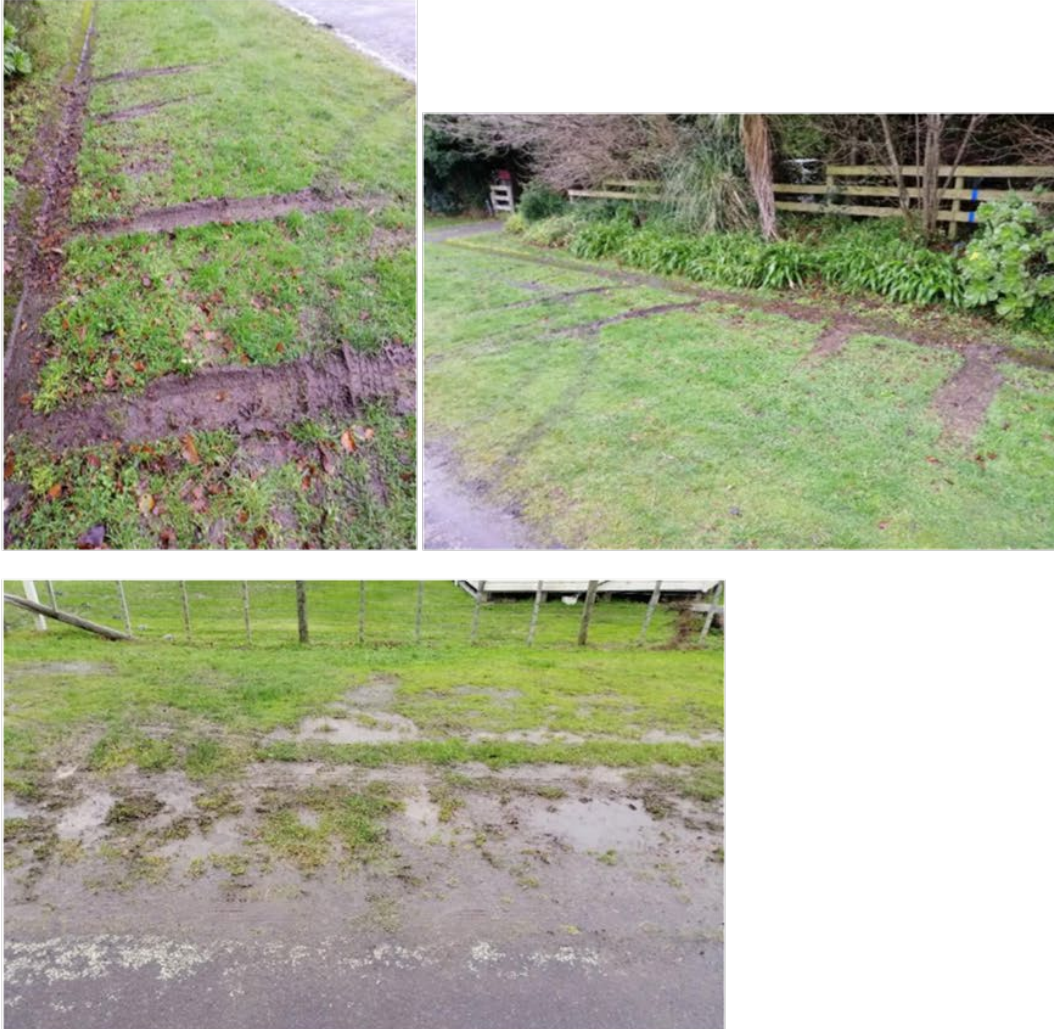
Images 8-10: Verges outside 69 Underhill Road after football practice, 3 July 2025

Vehicles park chaotically, making it difficult for residents of Titoki Grove and numbers 69 and 71 Underhill Road (and sometimes beyond) to enter or exit driveways and for children to be seen when crossing the road. After rain, verges become saturated and deeply rutted. Flooding is common on the verges outside 51-57 Underhill Road.