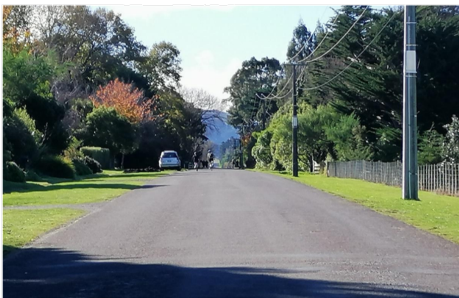
Image 17: Underhill Road looking north from outside number 73, showing cyclists and “runway” effect of straight stretch of open road beyond

“Straightening roads, widening them or adding passing lanes without visual cues all increase speed. Visual treatments such as narrowing and threshold treatments can counteract this effect.” - NZTA RR 300, “The influence of visual cues on speed behaviour”, https://www.nzta.govt.nz/assets/resources/research/reports/300/300.pdf