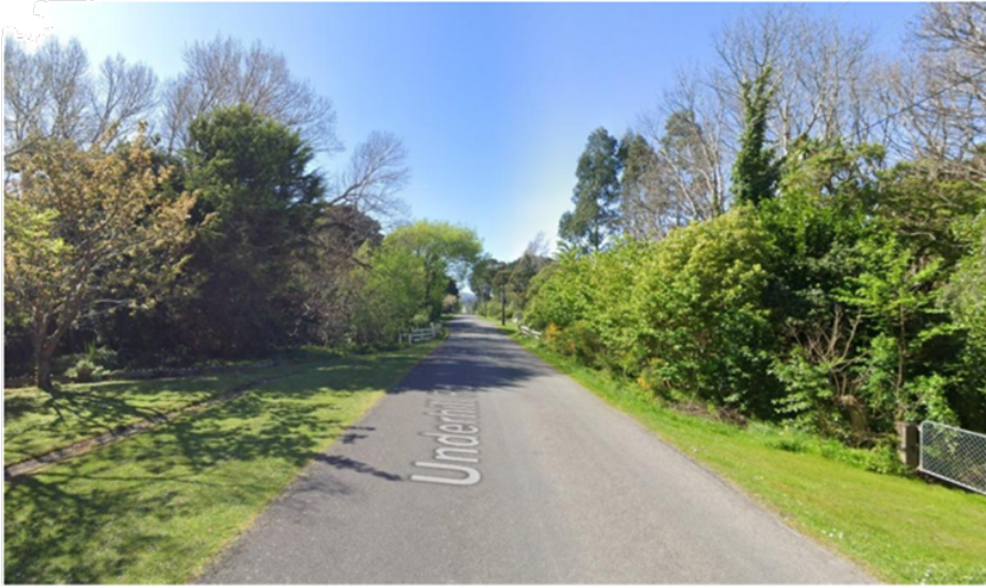
Image 18: Underhill Road looking north from outside number 79, showing bridge with (hidden) BBR access on left