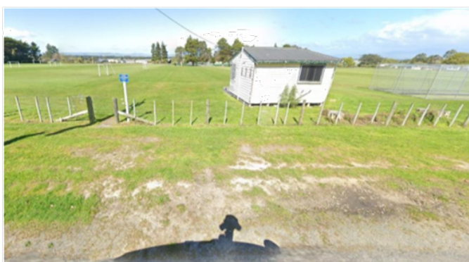
Image 12: Damage to verge months after football season has ended, September 2024, also showing small pedestrian gate and football clubhouse