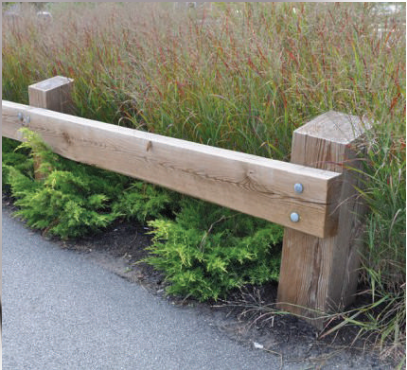
IMAGE A INDICITIVE TIMBER BARRIER DESIGN