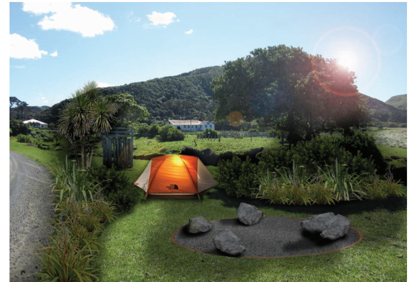
PICTORIAL C MAIN SEATING AREA WITH EXISTING AND PROPOSED PLANTING