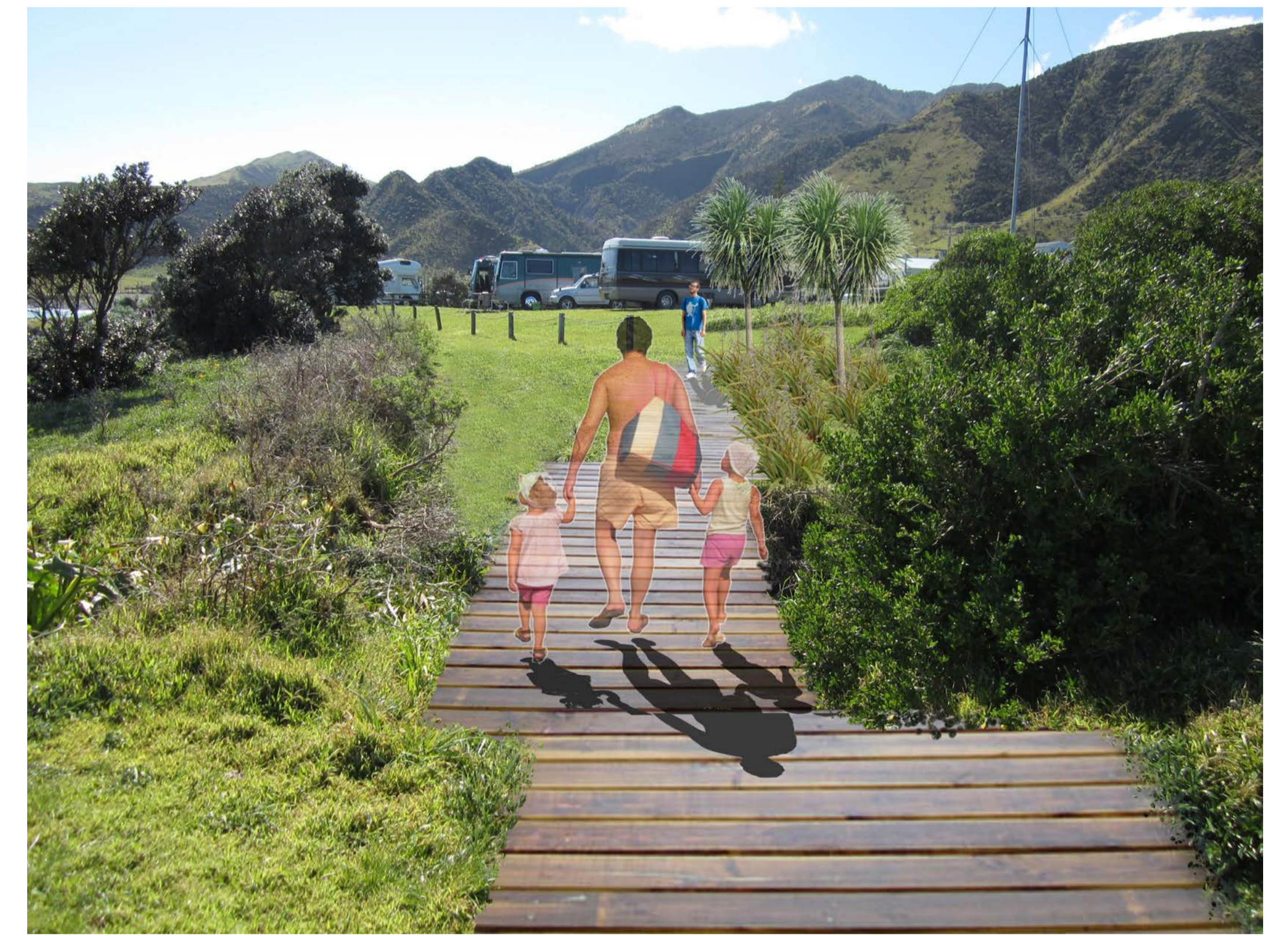
PICTORIAL D TIMBER BOARDWALK OVER EXISTING STREAM