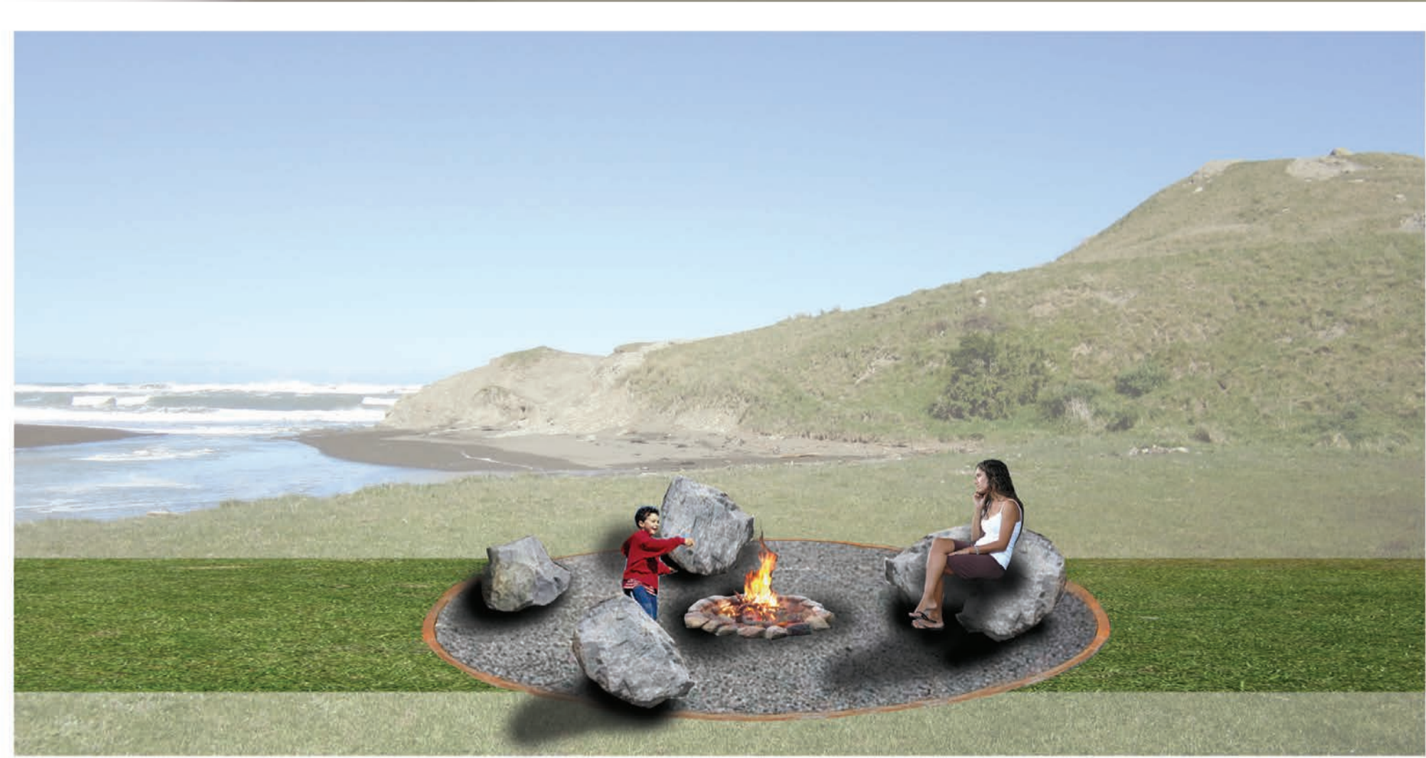
PICTORIAL E FIREPIT AND SEATING AREA

main firepit picnic area with feature rock seating and timber boardwalks to access bins