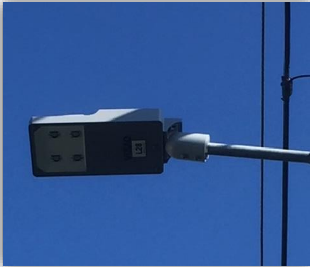
New LED light installed

This year's Bridge inspections have been completed by Calibre Consulting, an assessment of the inspection reports is being carried out to identify programmes next year's maintenance activities.