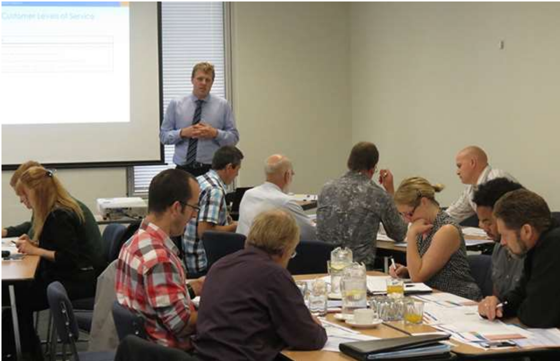
Figure 1 workshop on development of the performance measures and targets