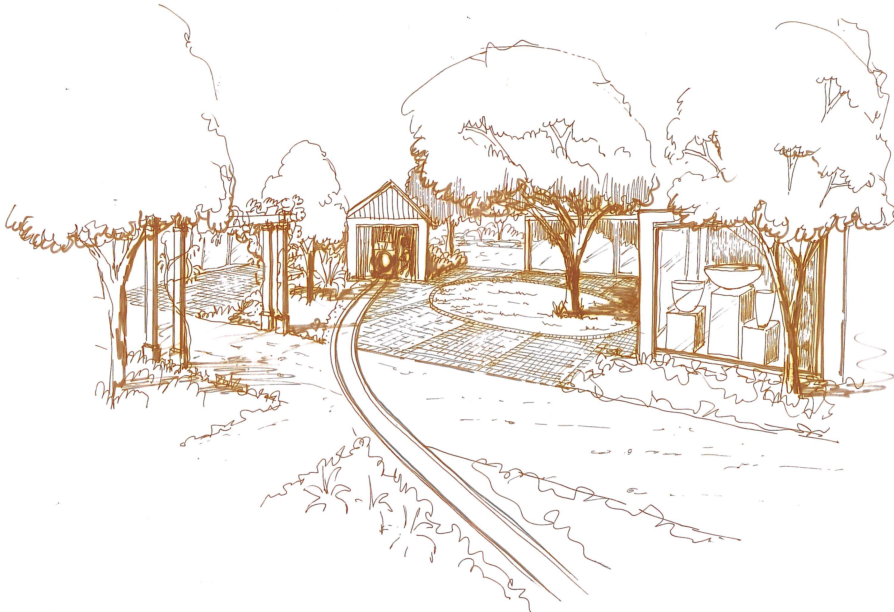
VIEW INTO ARTISTS QUARTER, MINIATURE RAILWAY SHED AND ARTISTS COURTYARD