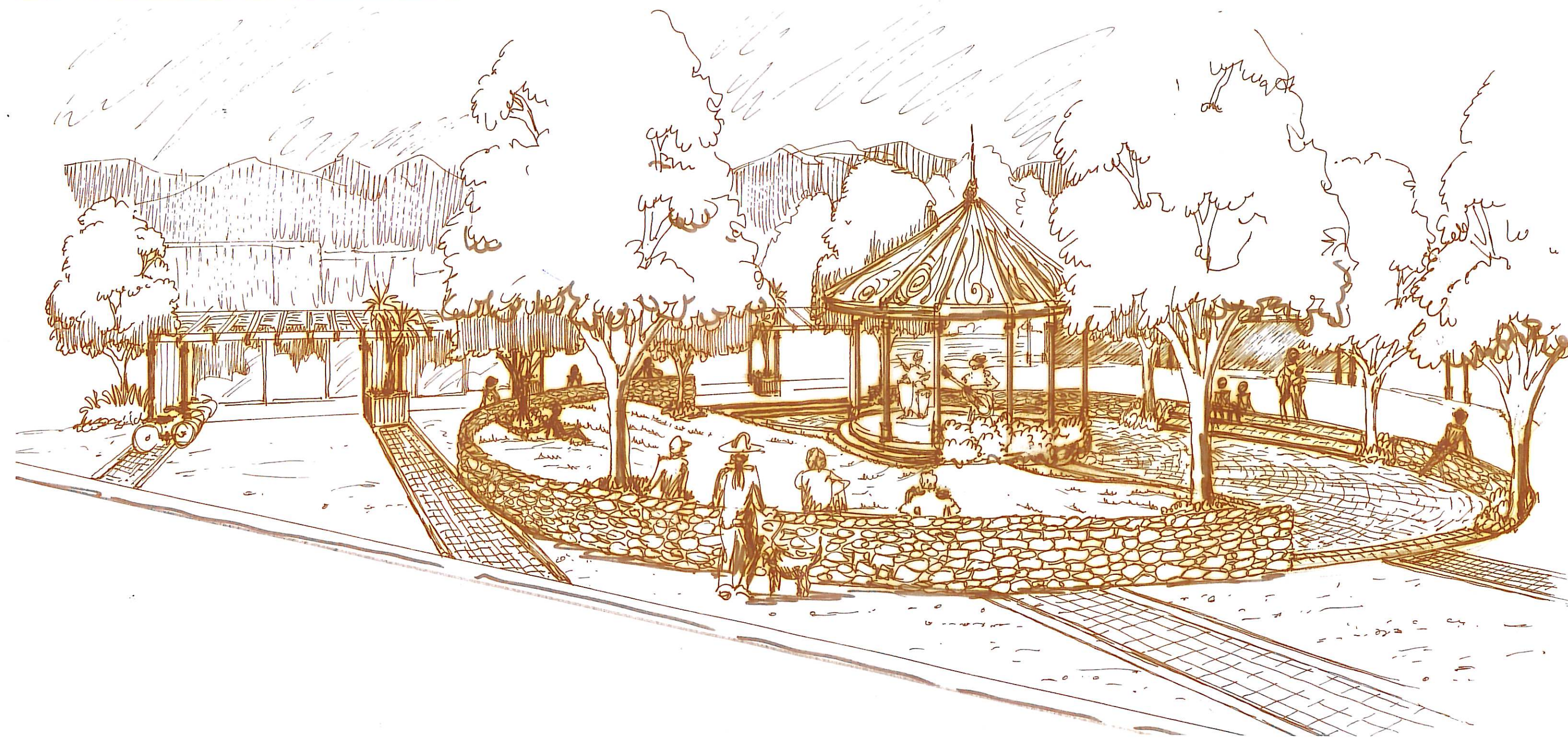
VIEW OF CENTRAL AREA SHOWING SUNKEN COURTYARD, SLOPING LAWN AMPHITHEATRE AREA AND CENTRAL PERFORMANCE SPACE