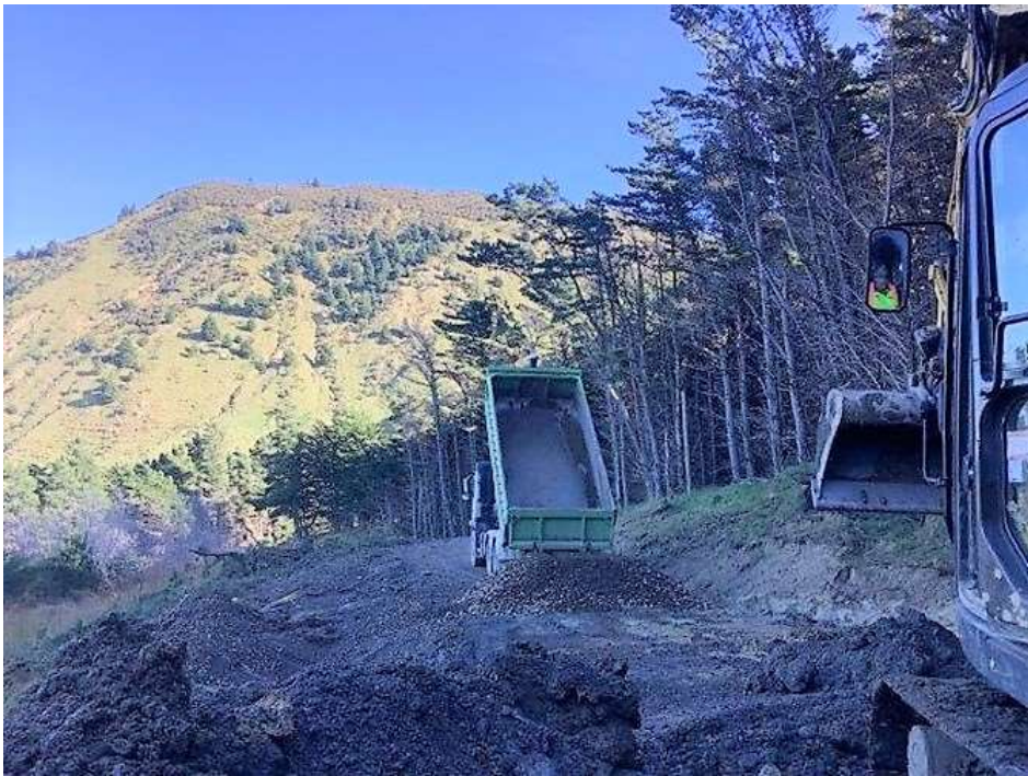
Trucks carried in countless cubic metres of material to fill slumped sections