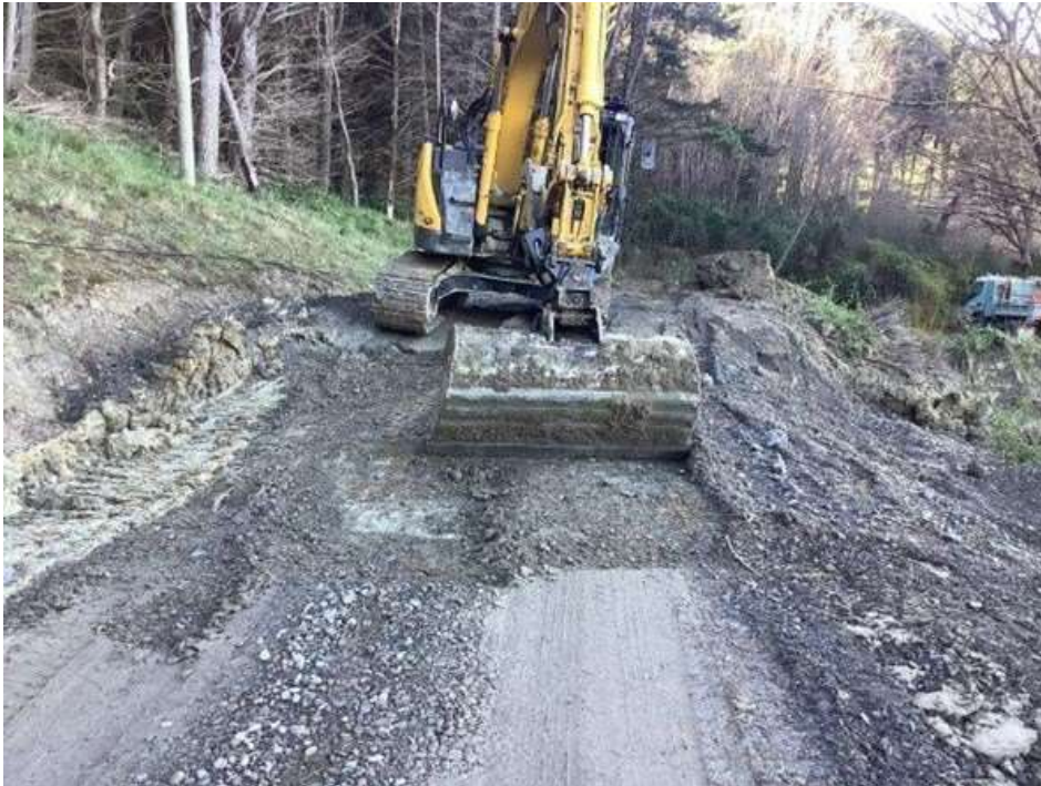
Grading to even out the damaged road following filling