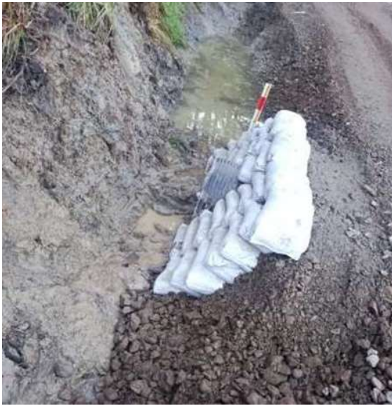
Sandbags used to backfill slumps before the road can be filled up and graded