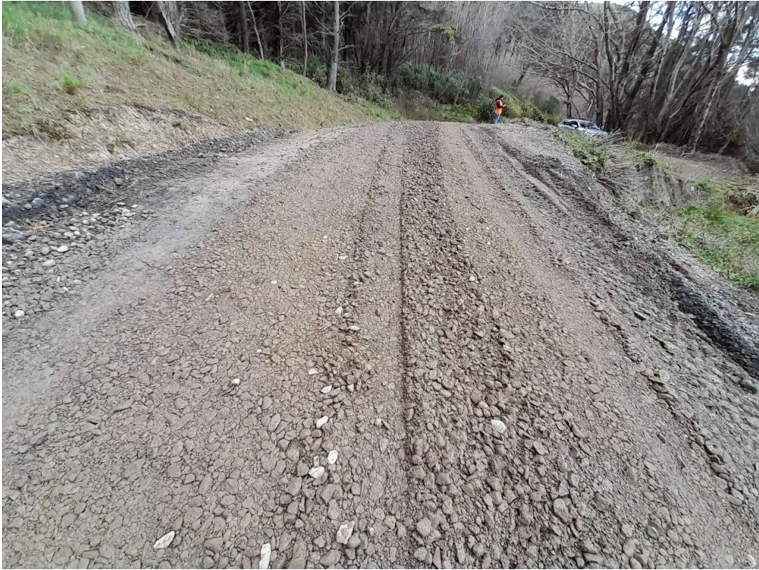
Newly graded filled section