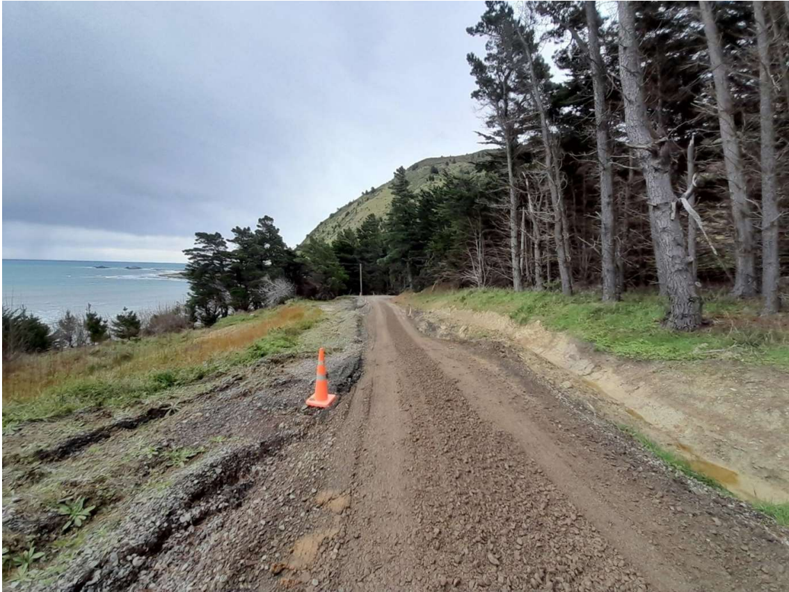
Further damage from the elements visible along another segment of the road