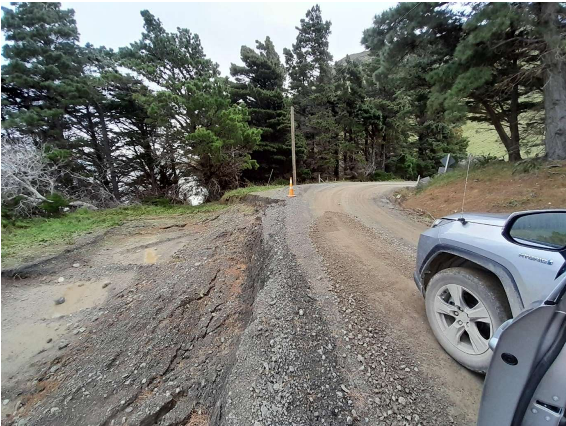
Deteriorating road base evident from the banks