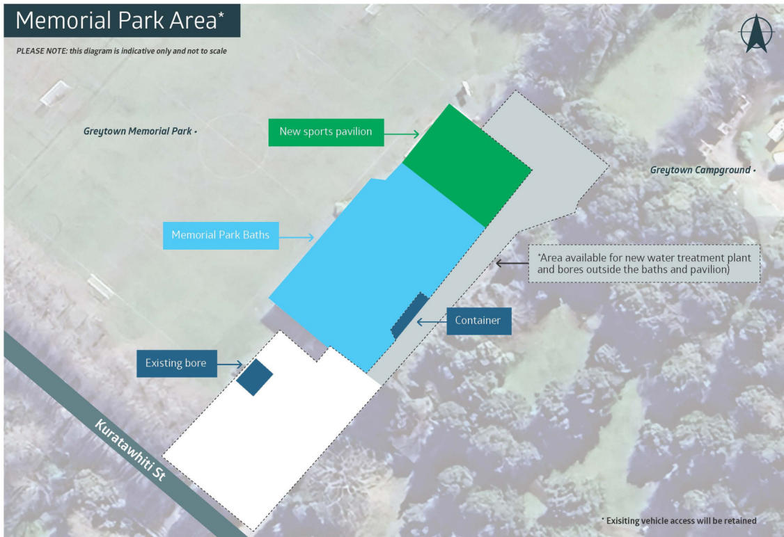
Image: Soldiers Memorial Park Area showing existing infrastructure and potential area for a new bore.

This option is to build an additional bore in Soldiers Memorial Park and utilise the existing infrastructure in the park. In 2021, the Council approved an easement under Section 48 of Reserves Act 1977 next to the pool in Soldier Memorial Park to place the new water treatment plant which is shown as a 'container' in Image 1.