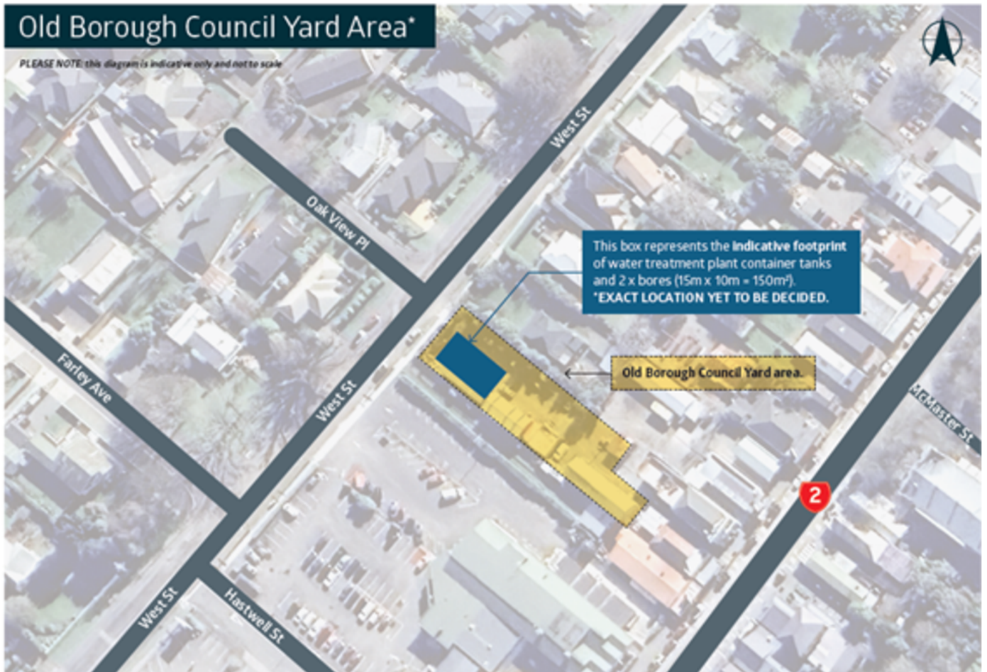
Image: Old Borough Council Yard showing the potential location of the water service treatment plant.

This option is to build a new water service treatment plant and bore on council owned land. Noting that the Menz Shed is currently located on this site and the additional costs to the Soldiers Memorial Park option relates to the installation of a new chlorine dosing system.