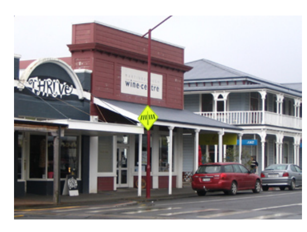
Martinborough has many good examples of buildings which have been restored using colours and materials which are consistent with the original heritage style of buildings.