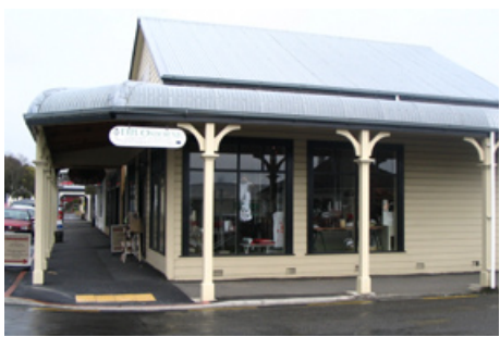
These shops incorporate signage well with the buildings' structure and use colours and lettering in keeping with the buildings heritage style.