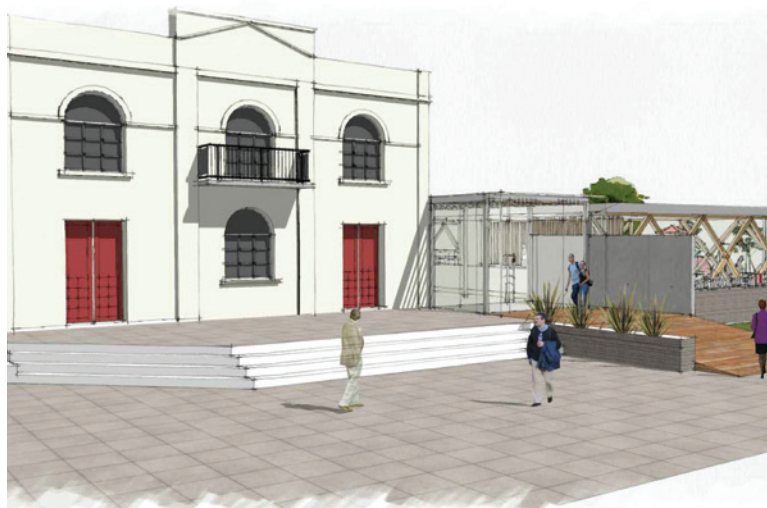
The new Town Hall from an artist's perspective

Plans for a new Community Centre in Martinborough were shared with the community at a public meeting on Thursday 3rd April. The Town Hall Working Group and SGL (professional leisure planners and funding advisors) have come up with a proposal that will transform the Martinborough Town Hall and surrounding area into a community hub, with plans incorporating a new Library space, Plunket, the Toy Library and the i-Site.