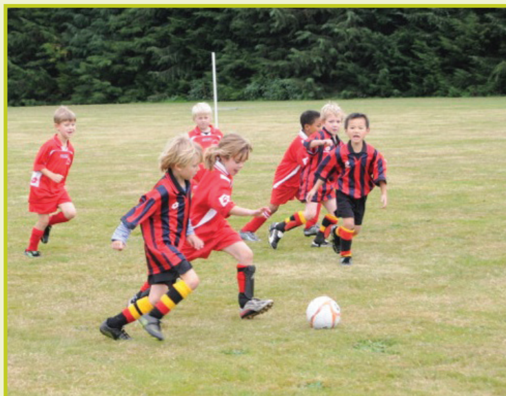
Junior Soccer, photo courtesy of Donald Yee Photographer.

Applications will be considered September 2013.