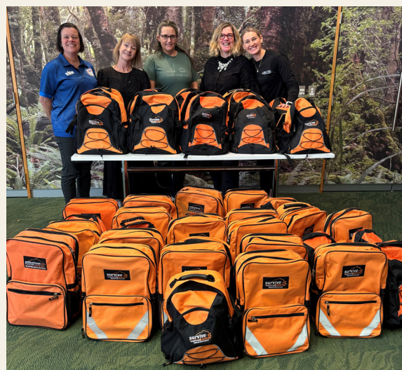
Above: The Grab & Go Bags for older residents.

(Carterton District Council) for donating notebooks and pens and Life Pharmacy and Unichem Southend in Masterton (50 hand sanitisers). The first 50 bags are a pilot project. It is hoped that more will be possible.