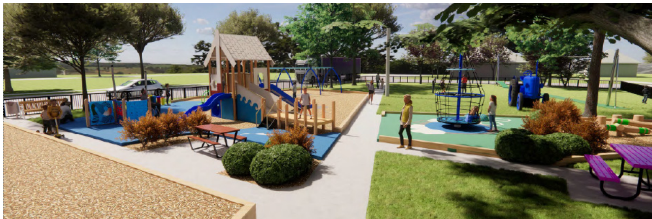
Above: A render image showing one aspect of the refurbishment to Joy Cowley Park.

One of New Zealand's most prolific writers and famous authors has a park named after her in the South Wairarapa town in Featherston.