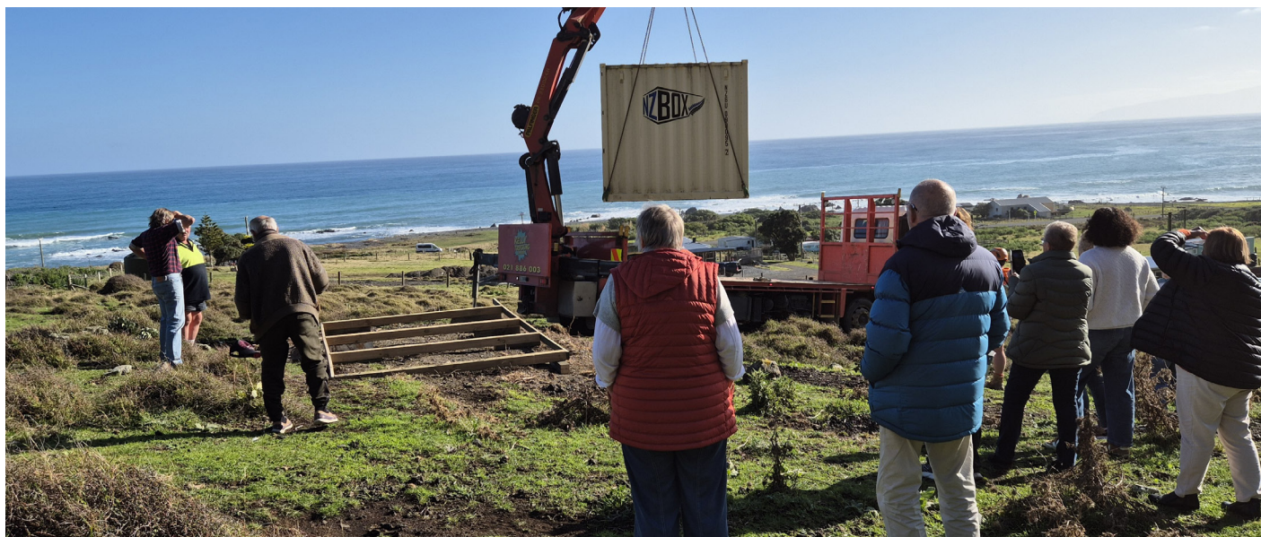
Above: One of two new emergency resource containers is lifted into place on the South Wairarapa Coast this year.