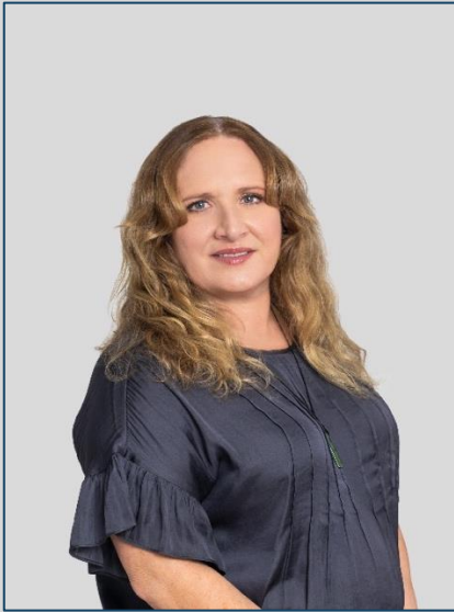
Louise Brown Chair